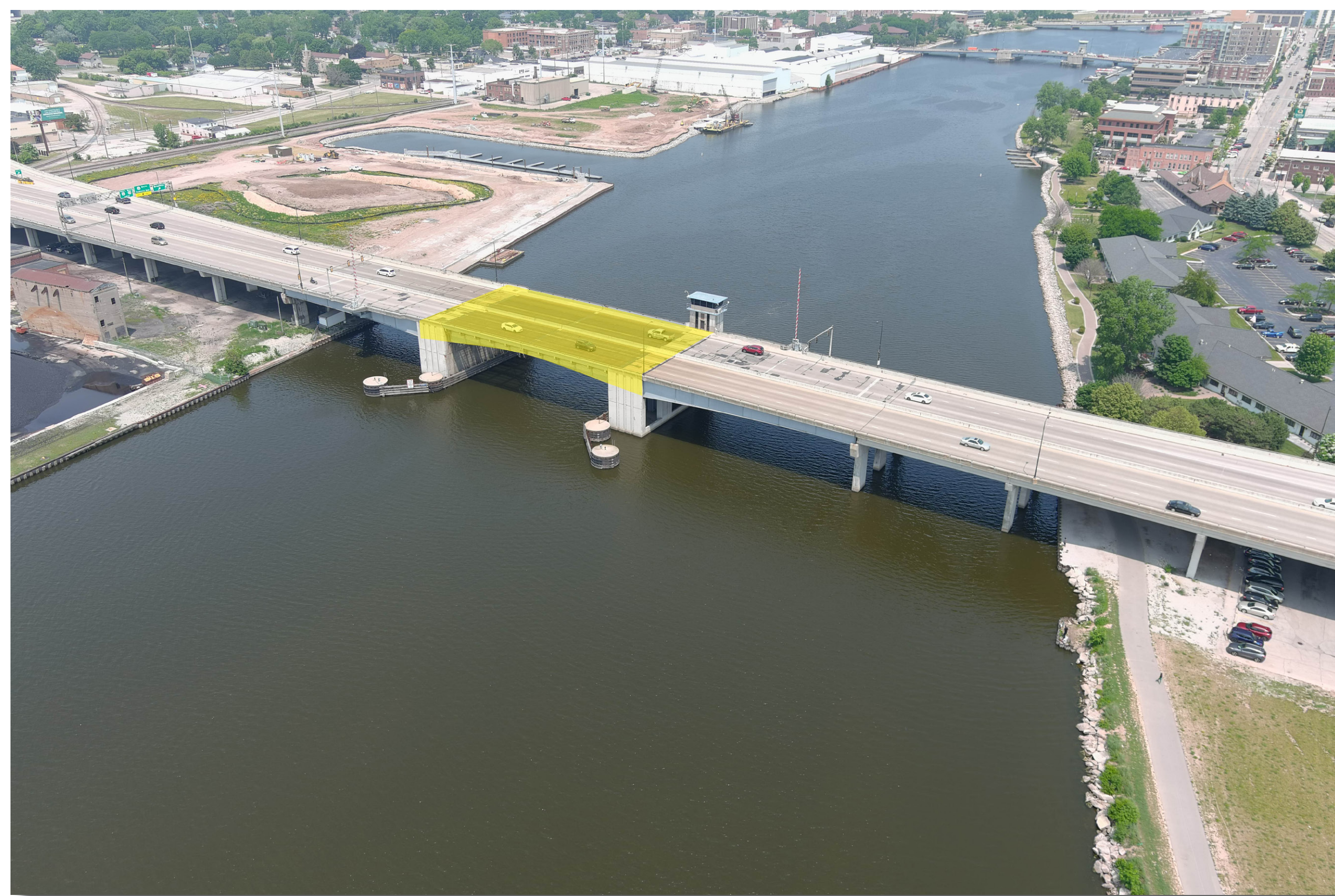
Bascule Span (Movable Portion) Highlighted In Yellow