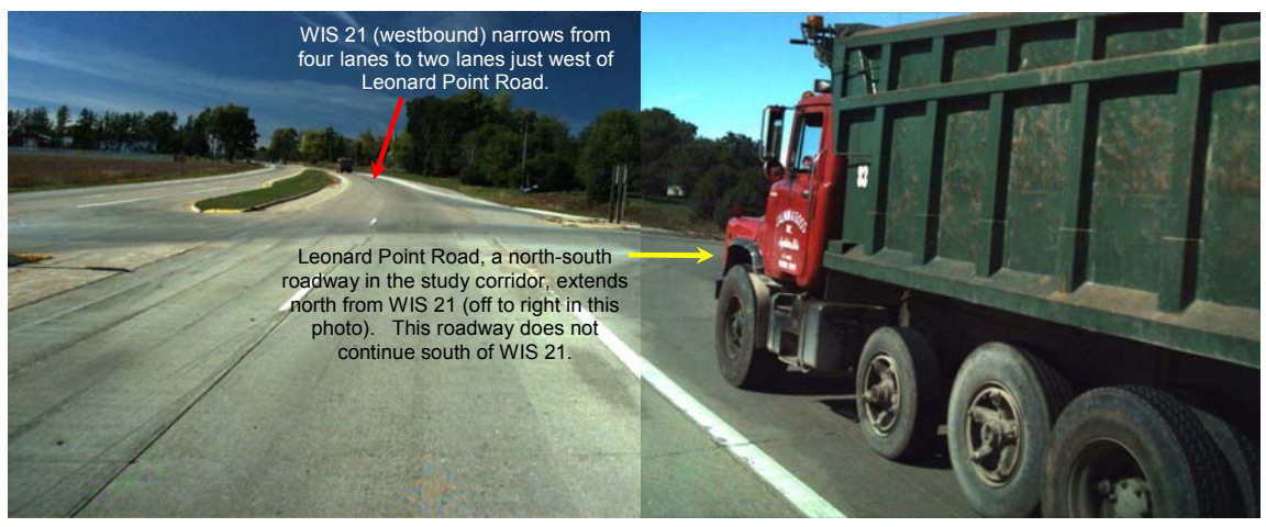
Several respondents indicated the segment of WIS 21 near Leonard Point Road creates a bottleneck as the road narrows from four-lanes to two-lanes just west of this location. Other respondents added that between Oakwood Avenue and this location there is excessive travel speeds as motorists pass vehicles (especially trucks) to avoid traffic delays in the two-lane section of WIS 21.

Some stakeholders indicated they would like to see the WIS 21 corridor function as a high-speed facility. Specifically, some respondents indicated that WIS 21 is a regional corridor that should be widened to accommodate the rapid development and related traffic demand. However, many indicated the numerous access points (intersecting local roads and driveways) along the corridor are not conducive to high-speed travel. Nearly 35% of respondents identified access control as a potential transportation improvement.