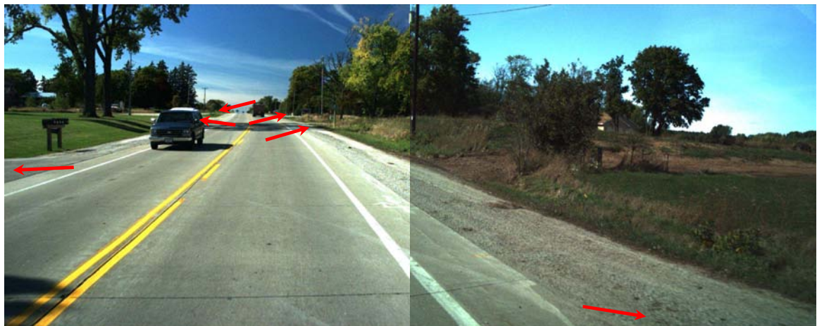
Respondents identified access along the two-lane section of WIS 21 as a concern. This segment, just west of Leonard Point Road, shows the location of six separate driveways with direct access to/from WIS 21 within less than one-quarter mile. The driveway access points are indicated by the arrows.