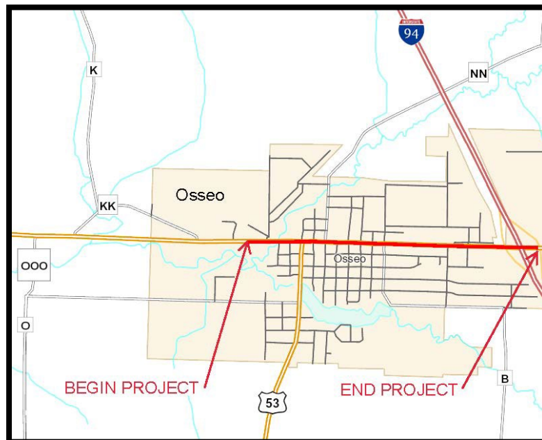
Project Location Map