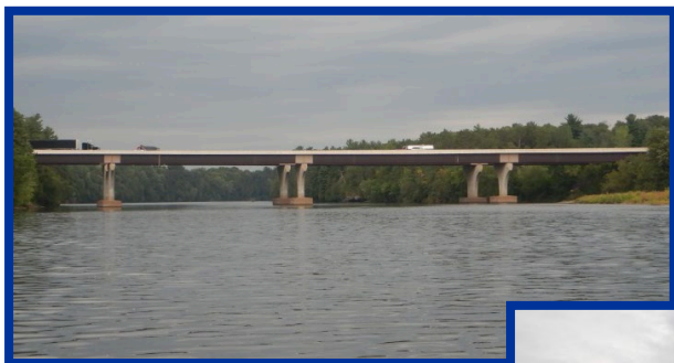
WIS 29 eastbound bridge: Built in 2002

Additional right of way will not be required for this project.