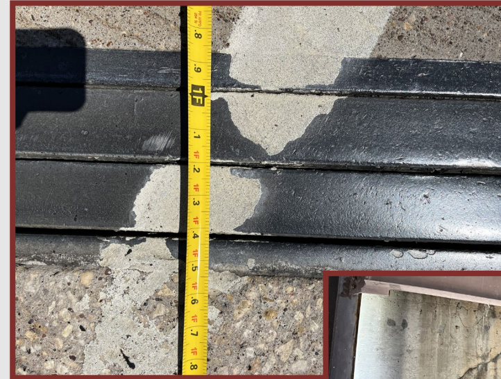
WIS 29 westbound bridge