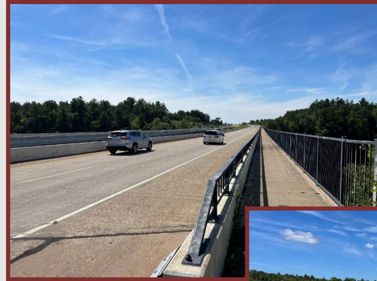
WIS 29 westbound bridge