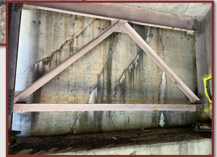
WIS 29 eastbound bridge