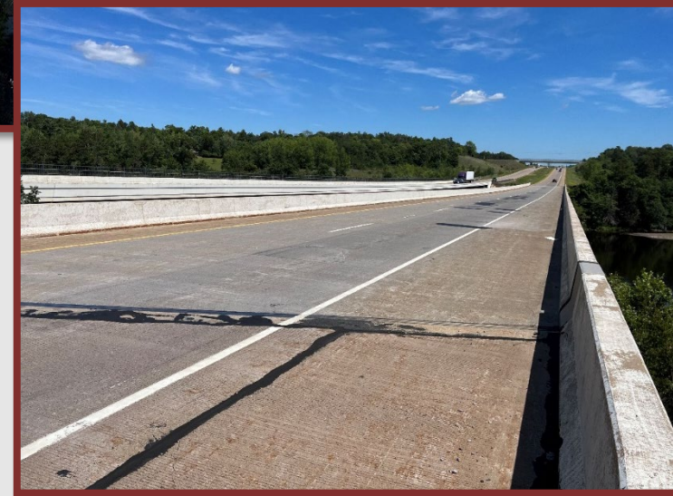
WIS 29 eastbound bridge