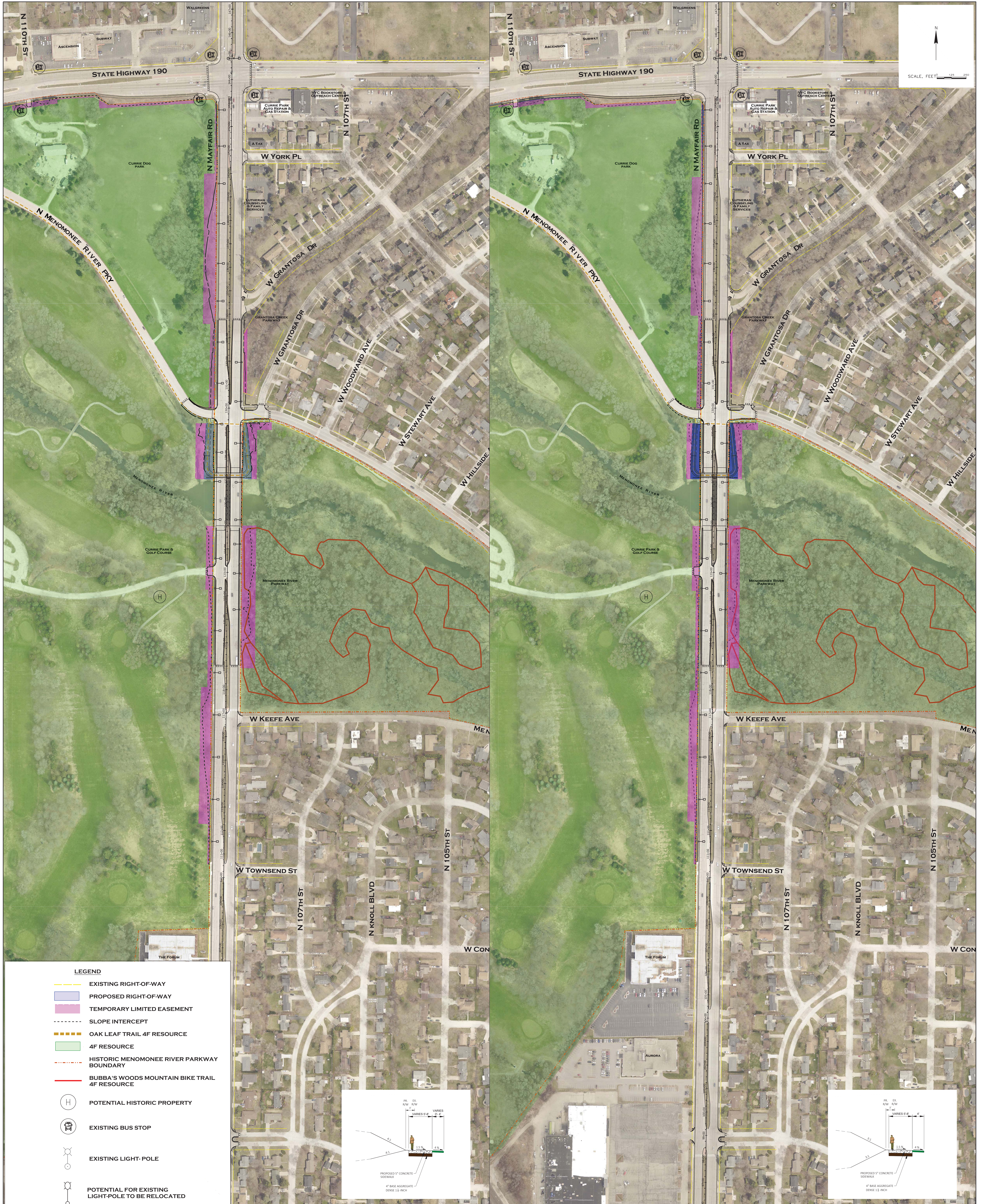
ALTERNATE 4 - 3:1 LANDSCAPED SLOPE WITH TERRACE