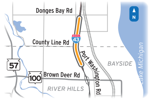
Above: County Line Road/ Port Washington Road Interchange Segment project limits