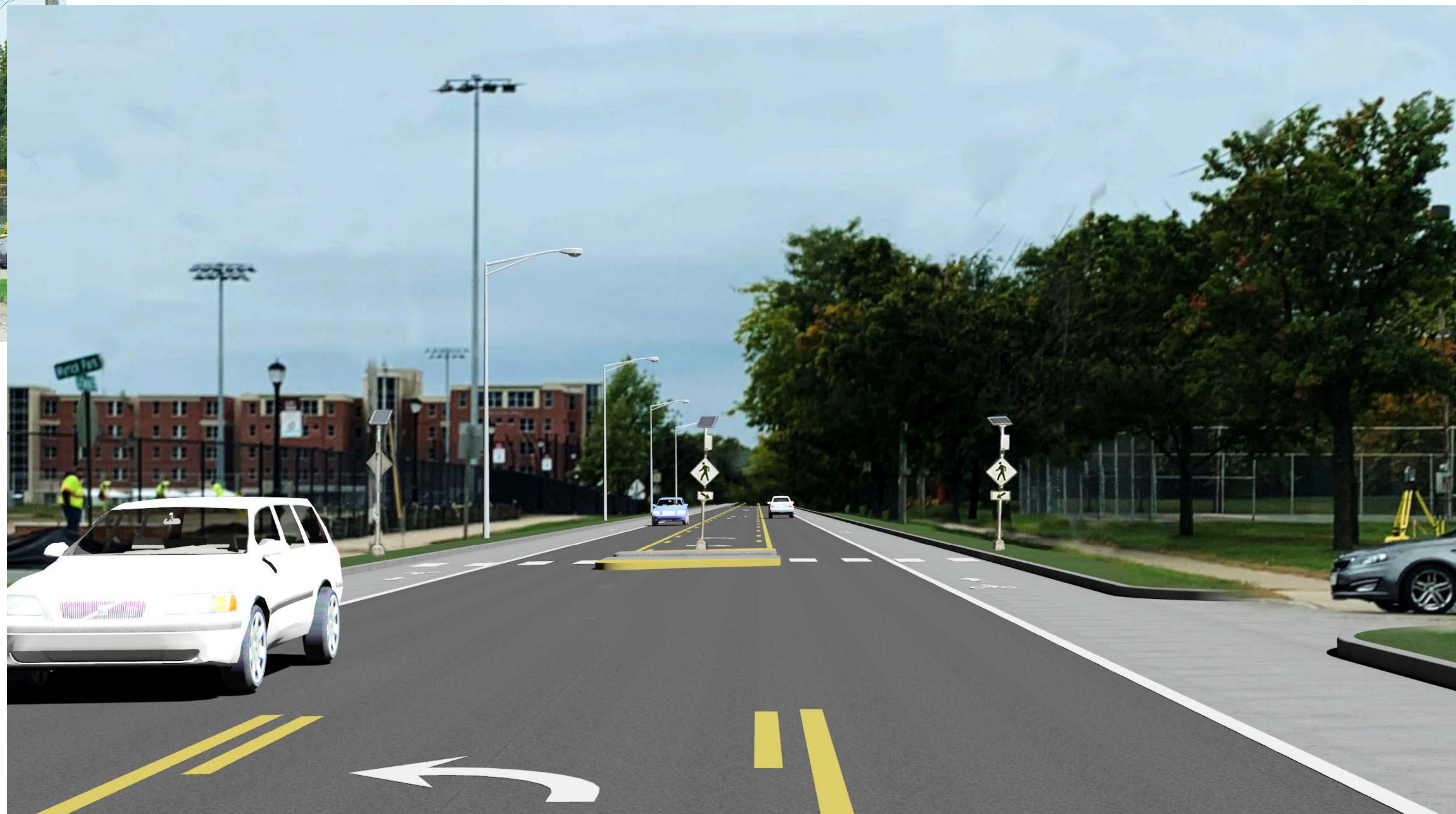
Proposed View Looking West from Hillview Ave