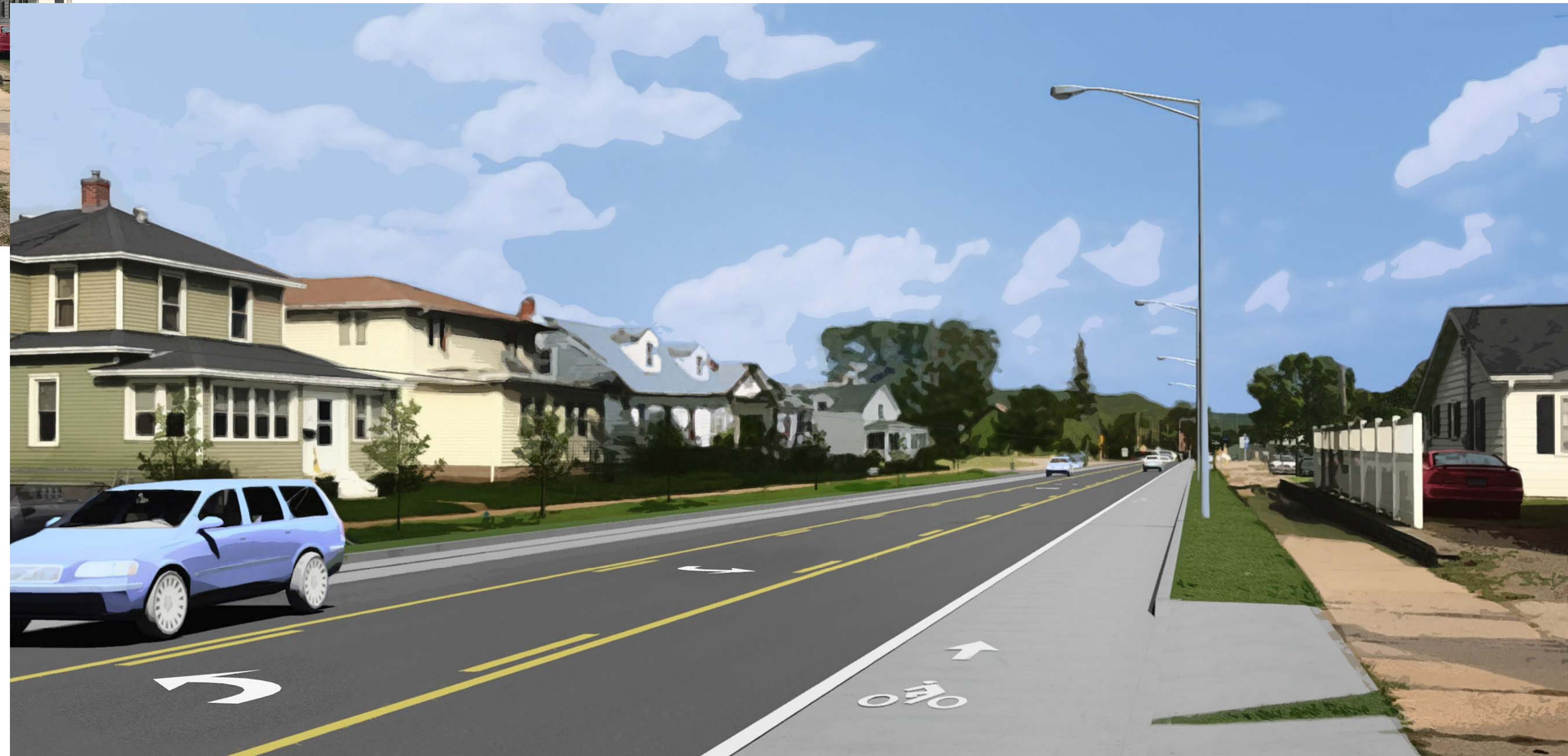
Proposed View Looking East