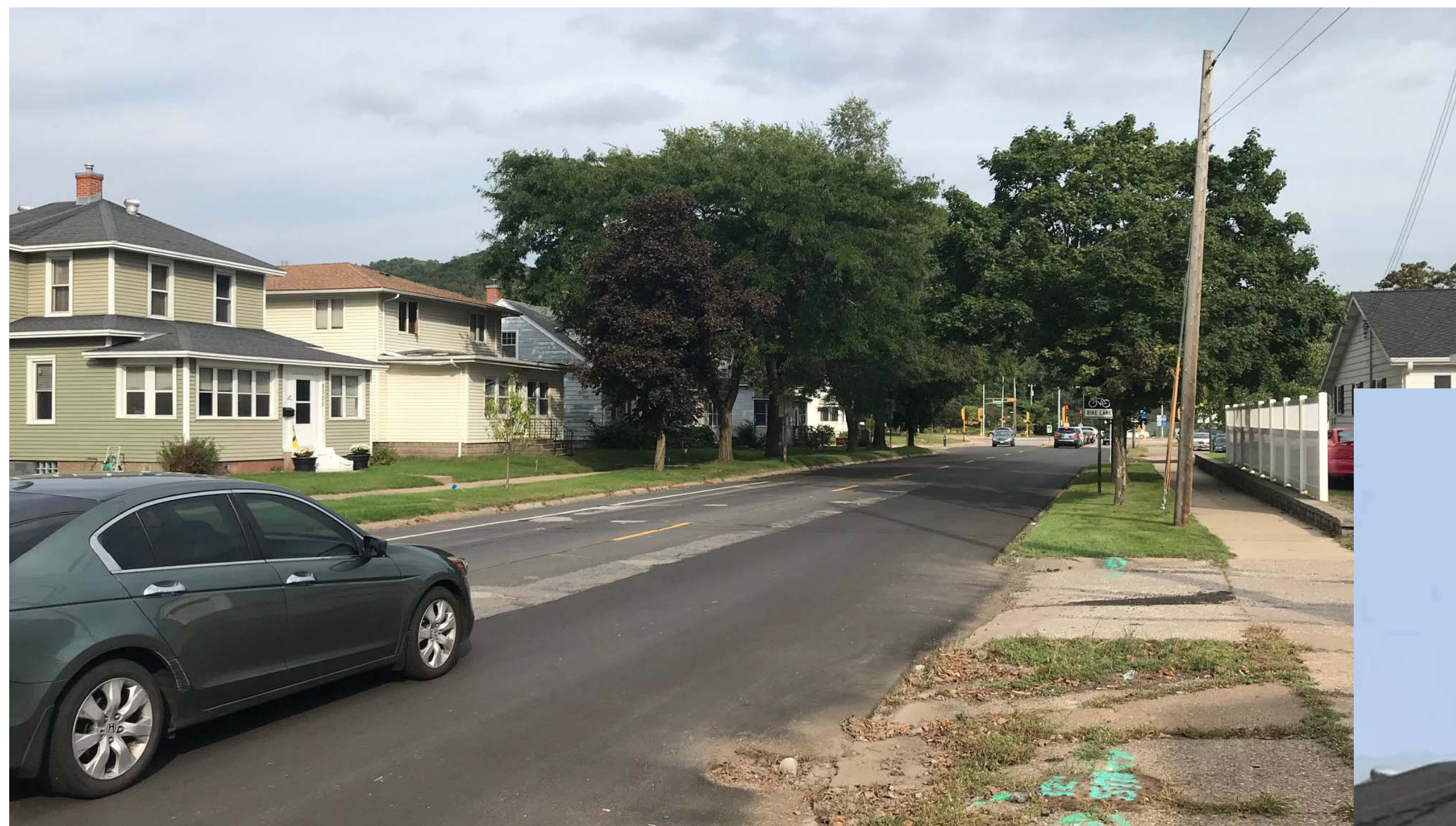
Existing View Looking East