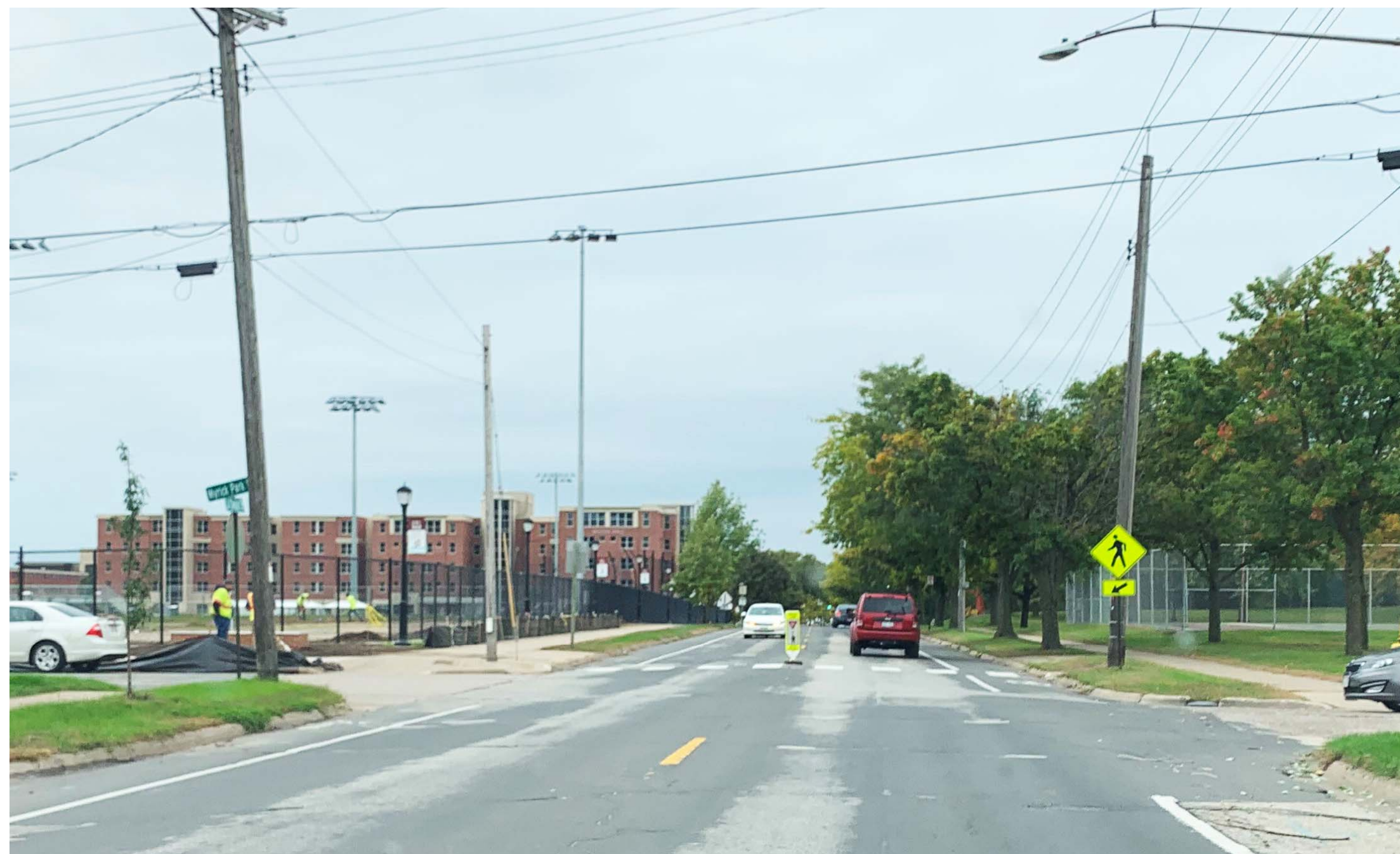
Existing View Looking West From Hillview Ave