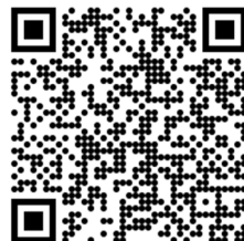
Figure 3: Project email sign up