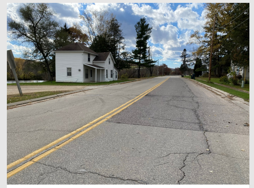
WIS 58 CRACKING IN CAZENOVIA