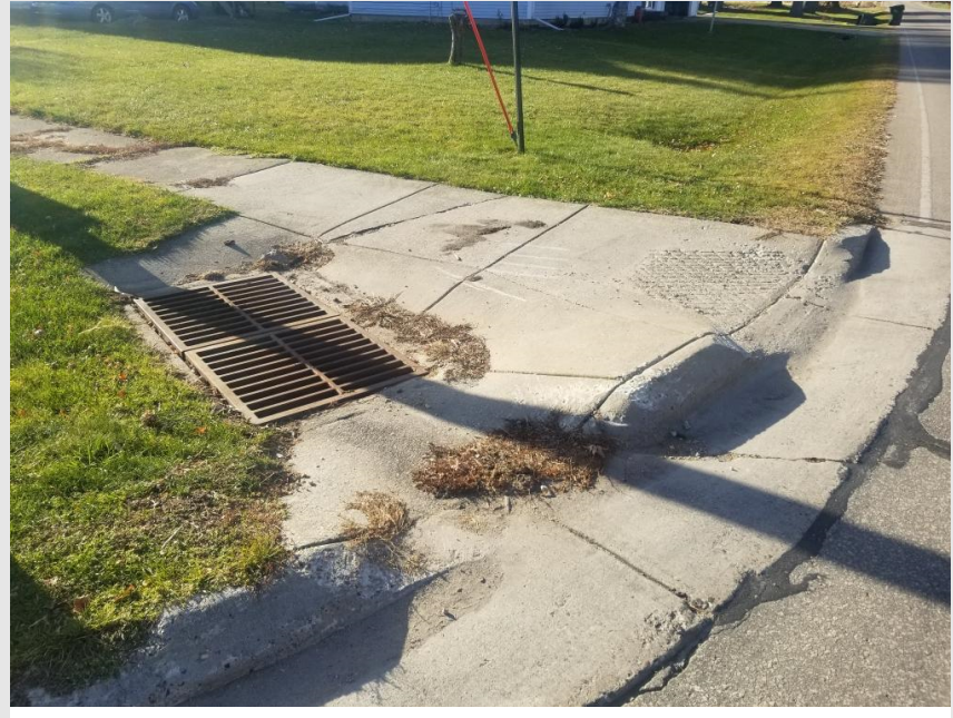
CURB RAMP 1 SOUTH OF WIS 58/COUNTY V INTERSECTION