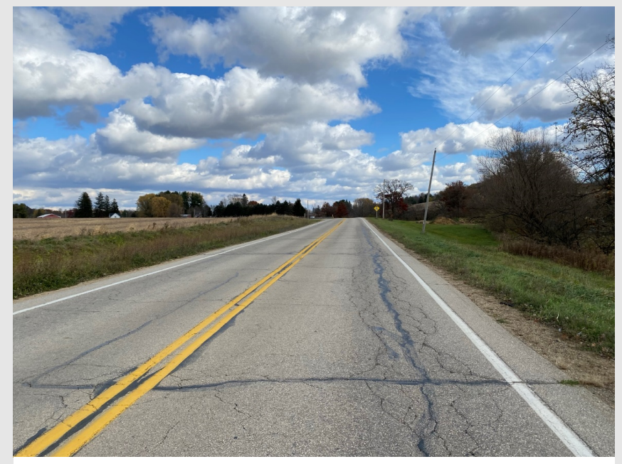
WIS 58 CRACKING AND RUTTING IN RURAL AREA