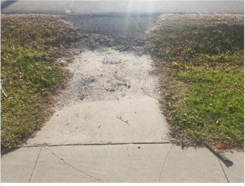
CURB RAMP 2 NORTH OF WIS 58/COUNTY V INTERSECTION