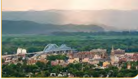
Port of La Crosse

F.J. Robers Co. has 26,000 square feet of covered storage space; 435,600 square feet of uncovered, paved storage space; and 1,306,800 square feet of uncovered, unpaved storage space.