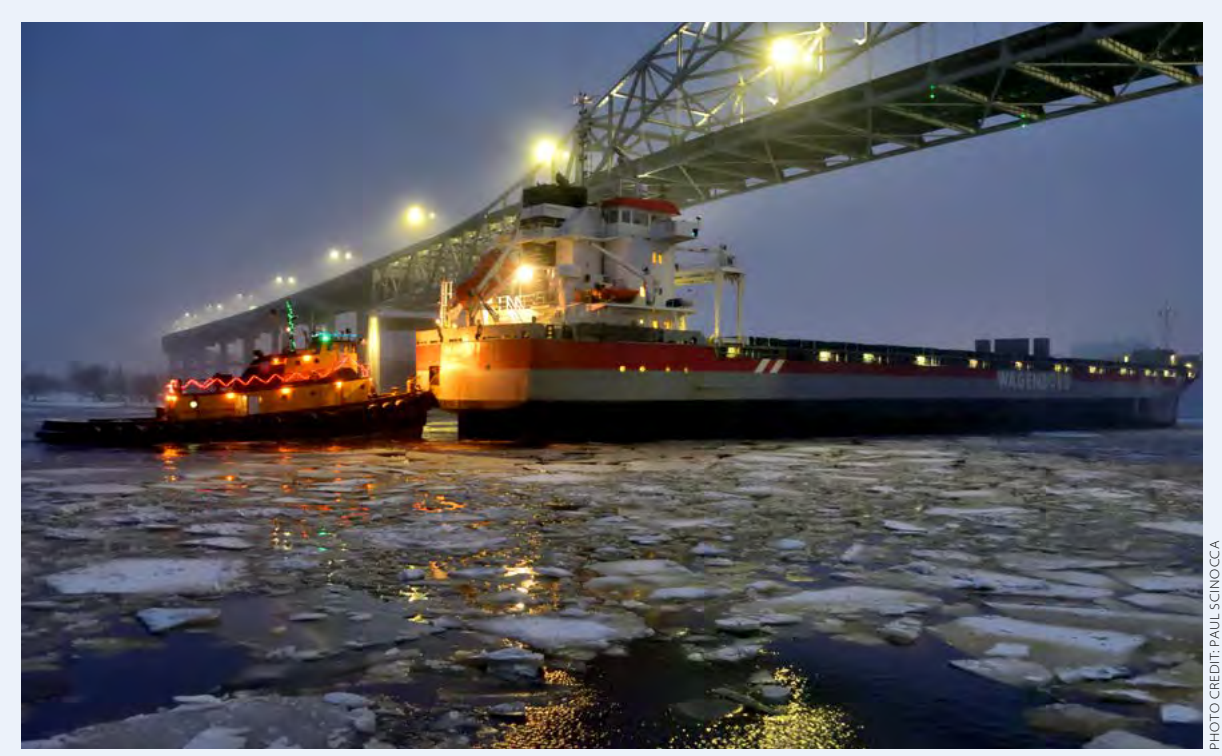
A ship passes under the Blatnik Bridge near Superior, Wis.

Ice breakers and other lake carriers directly impact Wisconsin's economy through off-season layup ship repairs in ports such as Superior, Marinette, and Milwaukee. The Lake Carriers' Association estimated that from 2021 to 2023, annual layup investment has averaged over $40 million in Wisconsin.