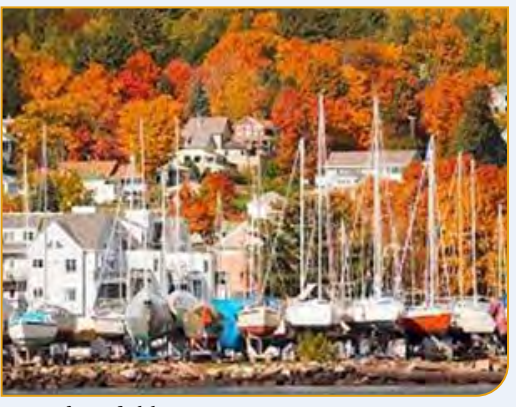
Port of Bayfield