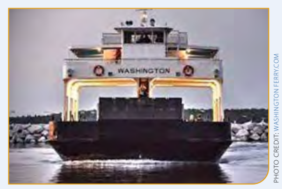
Washington Island Ferry

The Washington Island Ferry is located at the tip of the Door Peninsula, in the Northeast corner of Wisconsin. The Washington Island Ferry is accessed via WIS 42 at the Northport Pier. Their fleet uses Coast Guard-approved modern steel ferries that make up to 25 round trips a day during the high season and two round trips per day in the winter. Washington Island is a popular tourist destination.