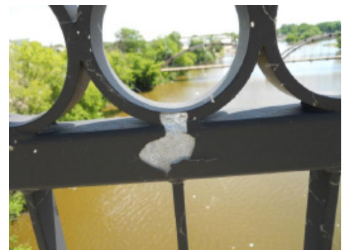
Jefferson bridge loss of adhesion in rail coating