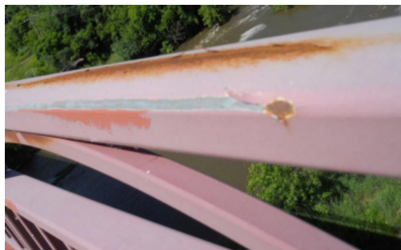
Baraboo bridge railing damage due to freezing

University of Wisconsin – Milwaukee algh@uwm.edu