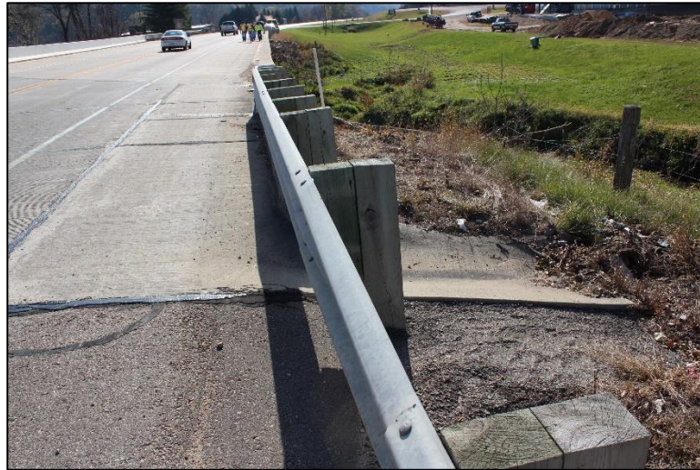
Figure 2.7.1-1: Assessment 9001 – Approach Drainage. Note concrete flume.

It is the inspector's task to examine each approach drainage assessment and reasonably assign the most severe assessment state to the "each" quantity. This will quantify the assessment's state of deterioration and help generate quantity/cost estimates for future remedial work.