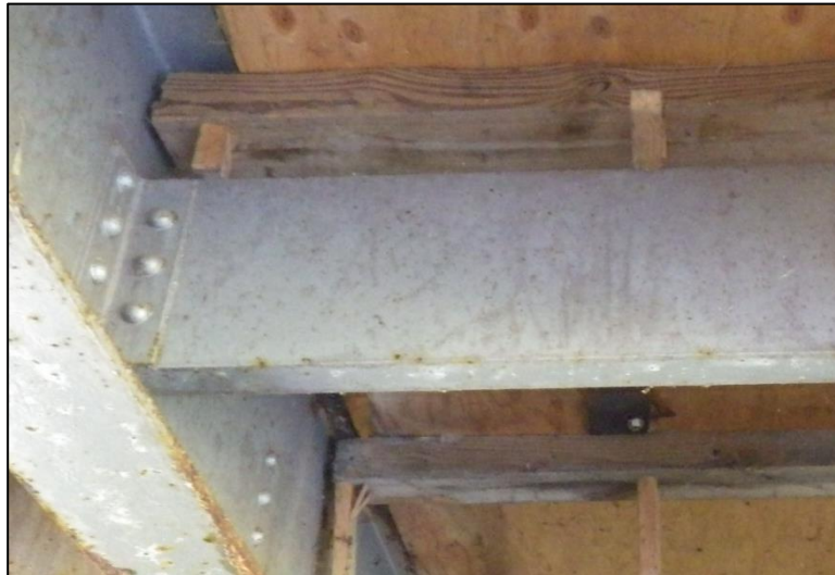
Figure 2.7.1-14: Assessment 9167 – Steel Diaphragm.

It is the inspector's task to examine each diaphragm and reasonably assign the most severe assessment condition to each assessment. This will quantify the assessment's state of deterioration and help generate quantity/cost estimates for future remedial work.