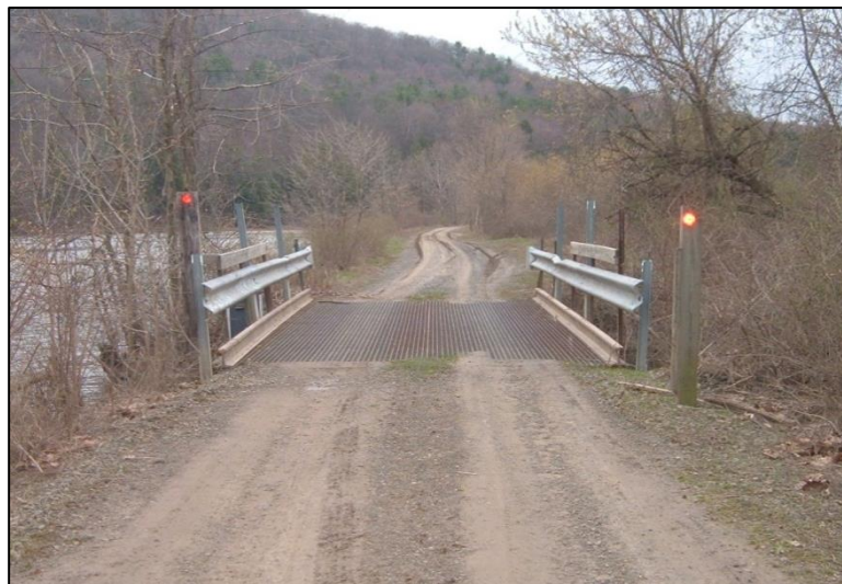
Figure 2.7.1-22: Assessment 9324 – Gravel Approach Roadway.

It is the inspector’s task to examine each system and reasonably assign the most severe assessment condition to each assessment. This will quantify the assessment’s state of deterioration and help generate quantity/cost estimates for future remedial work.