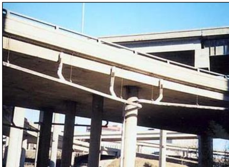
Figure 2.7.1-2: Assessment 9004 – Deck Drainage.

It is the inspector’s task to examine all deck drainage and reasonably assign the most severe assessment condition to each drain found within the limits of the bridge deck. This will quantify the assessment’s state of deterioration and help generate quantity/cost estimates for future remedial work.