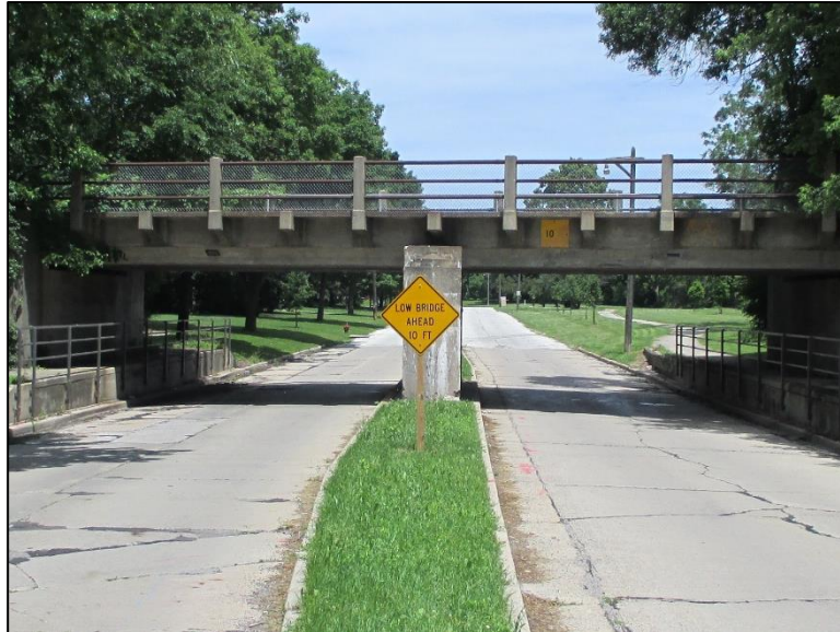
Figure 2.7.1-9: Assessment 9033 – Signs – Vertical Clearance.

It is the inspector's task to examine each sign and reasonably assign the most severe assessment condition. This will quantify the assessment's state of deterioration and help generate quantity/cost estimates for future remedial work.