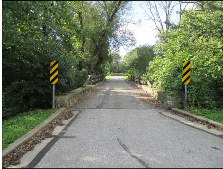
Figure 2.7.1-8: Assessment 9030 – Signs – Object Markers.