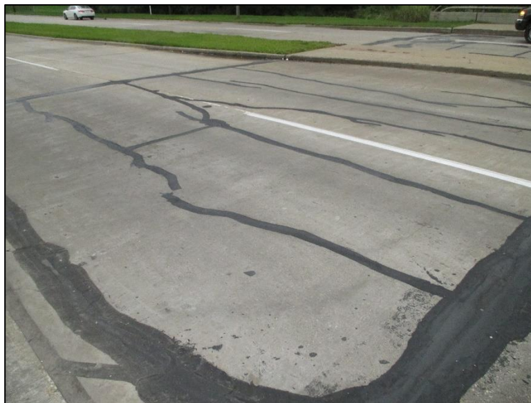
Figure 2.7.1-20: Assessment 9322 – Concrete Approach Roadway.

It is the inspector’s task to examine each system and reasonably assign the most severe assessment condition to each assessment. This will quantify the assessment’s state of deterioration and help generate quantity/cost estimates for future remedial work.