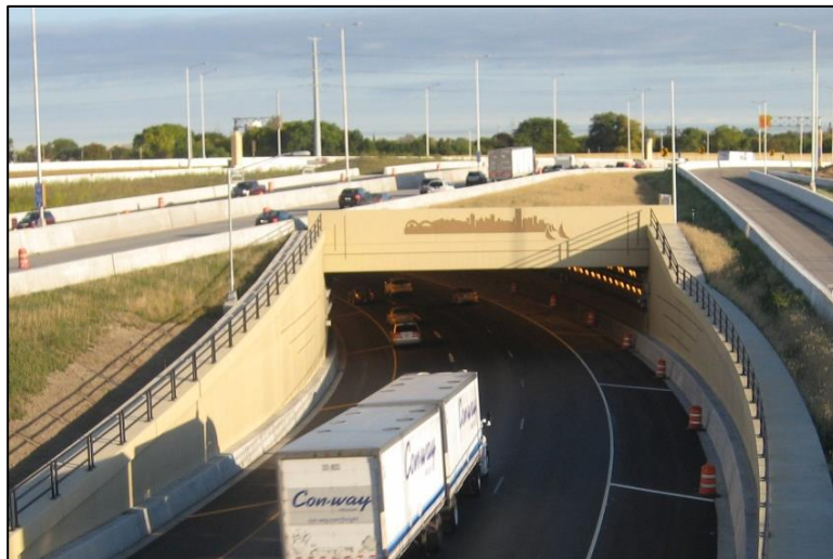
Figure 2.7.1-4: Assessment 9010 – Aesthetic Treatment.

assessment's state of deterioration and help generate quantity/cost estimates for future remedial work.