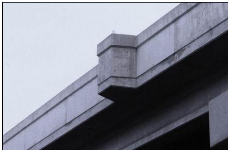
Figure 2.7.1-25: Assessment 9336 – Luminaire Bases.

It is the inspector’s task to examine each luminaire base and reasonably assign the most severe assessment condition to each assessment. This will quantify the assessment’s state of deterioration and help generate quantity/cost estimates for future remedial work.