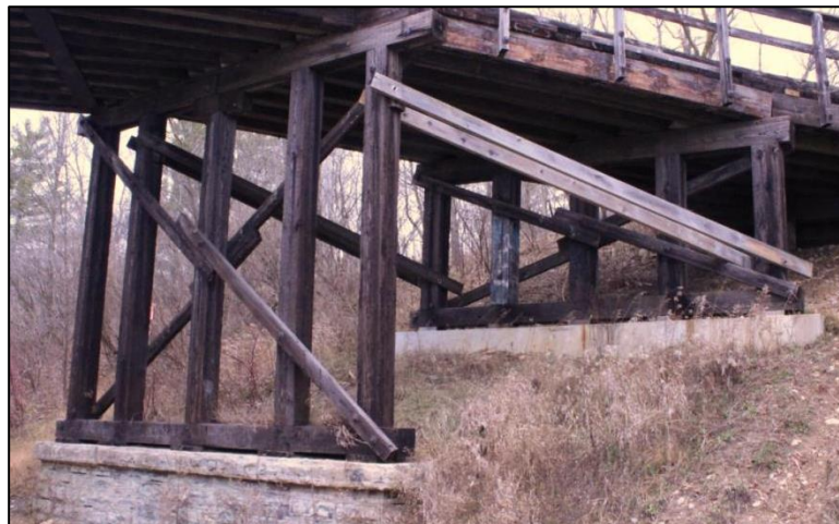
Figure 2.7.1-18: Assessment 9250 – Crash Walls/Web Walls/Cross Bracing or Struts.

It is the inspector’s task to examine each system and reasonably assign the most severe assessment condition to each assessment. This will quantify the assessment’s state of deterioration and help generate quantity/cost estimates for future remedial work.