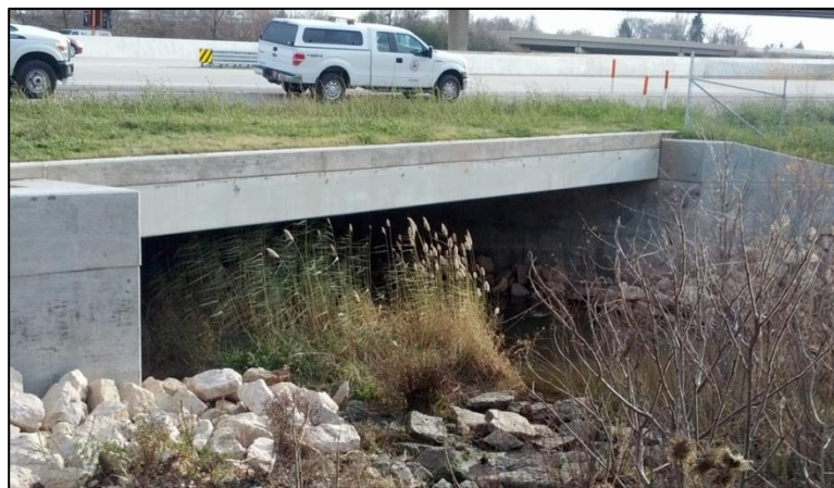
Figure 2.7.1-23: Assessment 9325 – Roadway over Structure.

It is the inspector’s task to examine each roadway and reasonably assign the most severe assessment condition to each assessment. Quantifying these amounts helps to generate quantity/cost estimates for future remedial work.