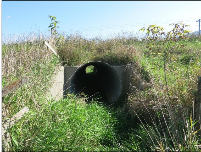
Figure 2.7.1-17: Assessment 9248 – Culvert End Treatment.