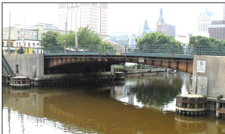
Figure 2.7.1-19: Assessment 9290 – Dolphin or Fender System.

It is the inspector’s task to examine each system and reasonably assign the most severe assessment condition to each assessment. This will quantify the assessment’s state of deterioration and help generate quantity/cost estimates for future remedial work.