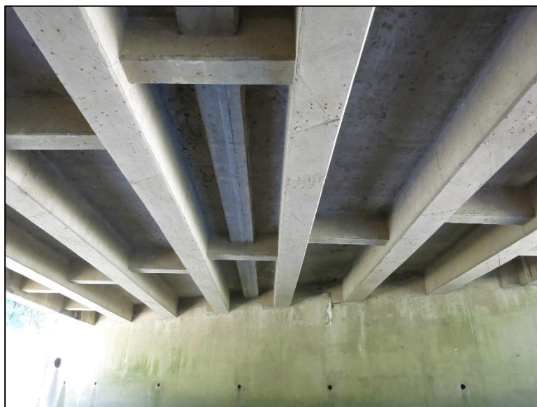
Figure 2.7.1-15: Assessment 9168 – Concrete Diaphragm.

It is the inspector’s task to examine each diaphragm and reasonably assign the most severe assessment condition to each assessment. This will quantify the assessment’s state of deterioration and help generate quantity/cost estimates for future remedial work.