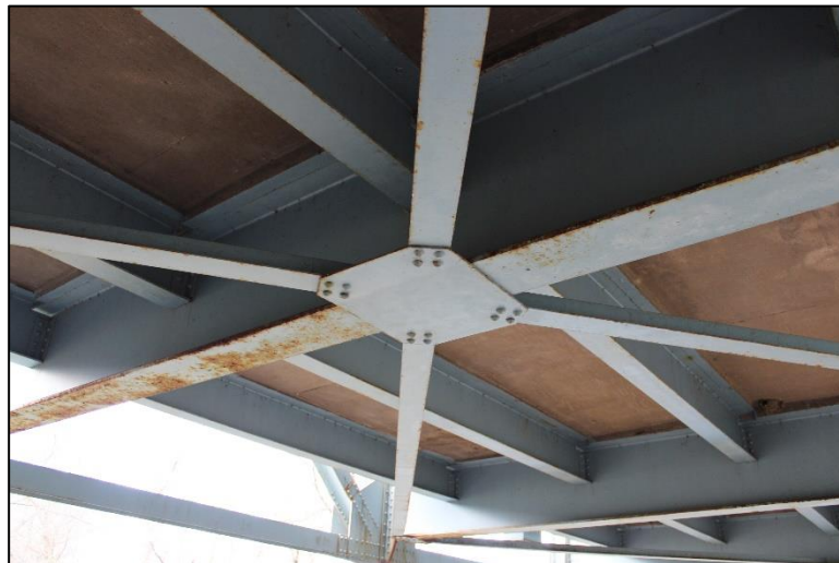
Figure 2.7.1-16: Assessment 9169 – Lateral Bracing.

On the inspection report form, lateral bracing systems are recorded in units of “each” per span of the bridge regardless of the number of trusses, bays, or girder lines. It is the inspector’s task to examine the lateral bracing system in each span and reasonably assign the most severe assessment condition to each assessment. This will quantify the assessment’s state of deterioration and help generate quantity/cost estimates for future remedial work.