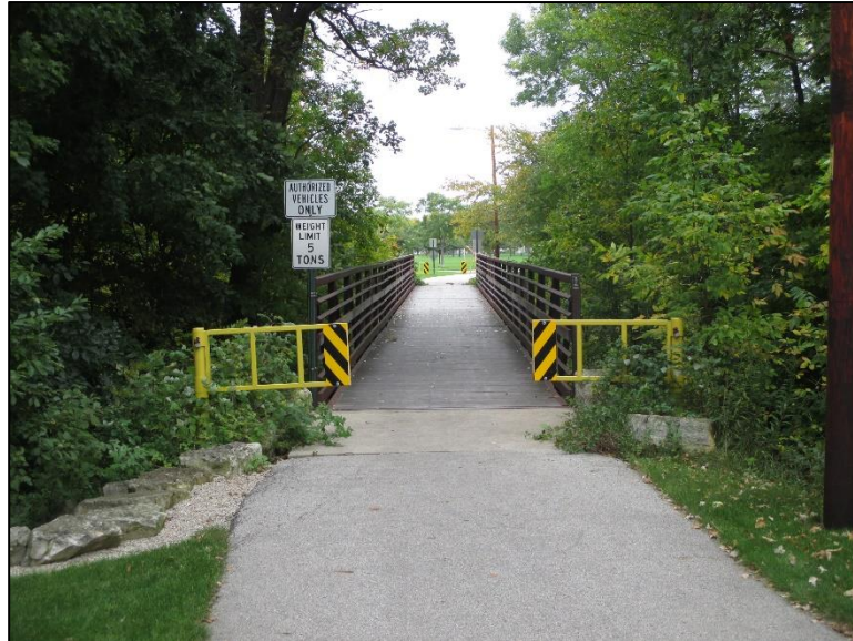
Figure 2.7.1-10: Assessment 9034 – Signs – Weight Limit Posting.

It is the inspector's task to examine each sign and reasonably assign the most severe assessment condition. This will quantify the assessment's state of deterioration and help generate quantity/cost estimates for future remedial work.