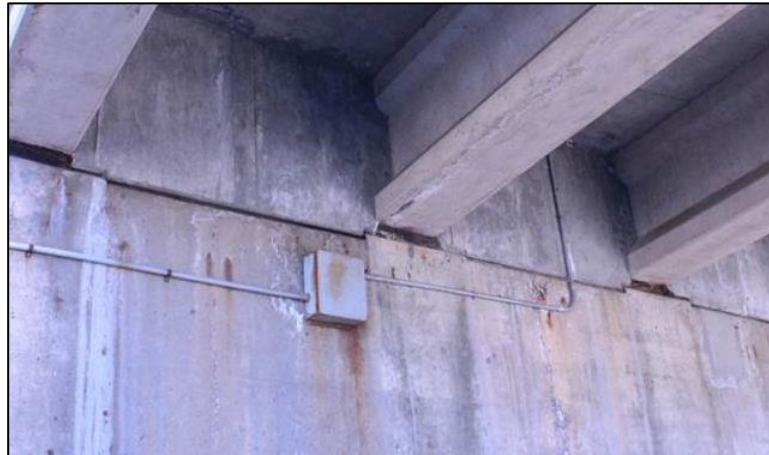
Figure 2.7.1-5: Assessment 9011 – Utilities.