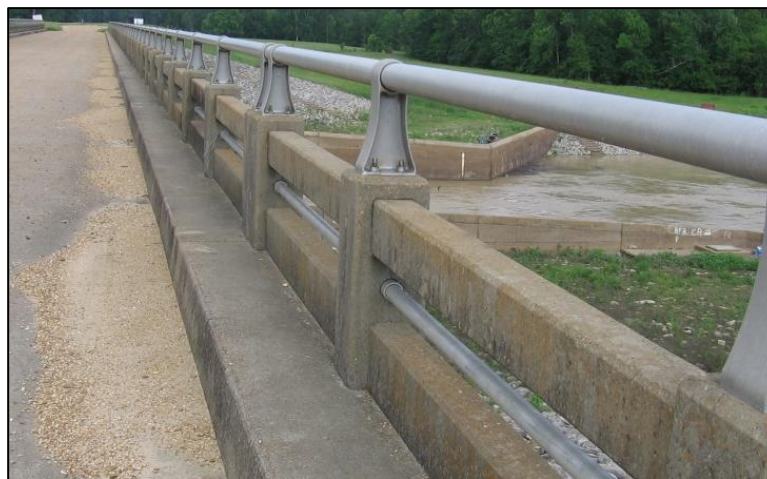
Figure 2.7.1-24: Assessment 9335 – Decorative Rail.

It is the inspector’s task to examine each decorative rail assessment and reasonably assign the most severe assessment condition to each assessment. This will quantify the assessment’s state of deterioration and help generate quantity/cost estimates for future remedial work.