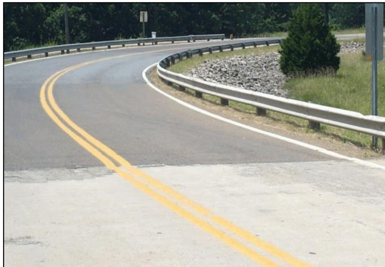
Figure 2.7.1-21: Assessment 9323 – Asphalt Approach Roadway.

It is the inspector’s task to examine each system and reasonably assign the most severe assessment condition to each assessment. Quantifying these amounts helps to generate quantity/cost estimates for future remedial work.