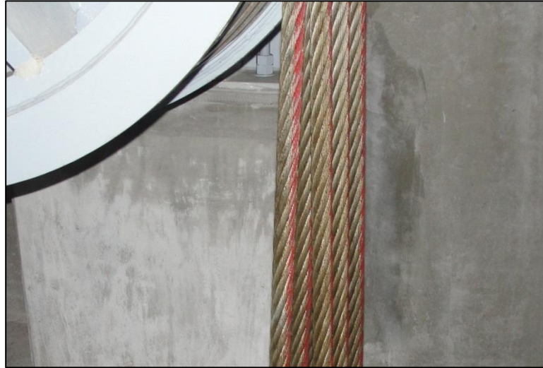
Figure 2.7.1-7: Assessment 9021 – Movable Bridge Cables.