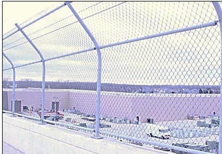
Figure 2.7.1-26: Assessment 9337 – Protective Screening

It is the inspector’s task to examine each protective screening assessment and reasonably assign the most severe assessment condition to each assessment. This will quantify the assessment’s state of deterioration and help generate quantity/cost estimates for future remedial work.