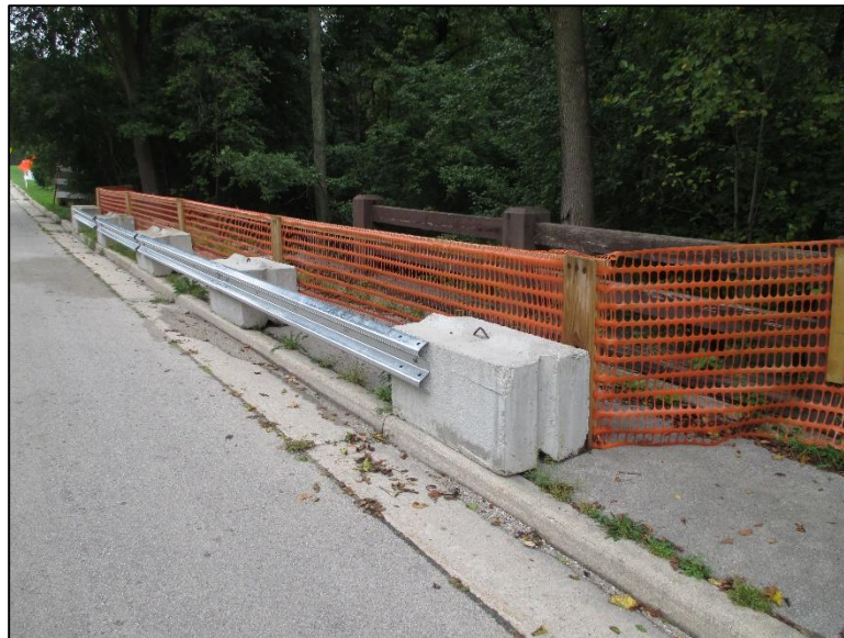
Figure 2.7.1-11: Assessment 9036 – Bridge Closure System. Note assessment used for sidewalk closure.

It is the inspector’s task to examine each bridge closure system and reasonably assign the most severe assessment condition to each assessment. This will quantify the assessment’s state of deterioration and help generate quantity/cost estimates for future remedial work.