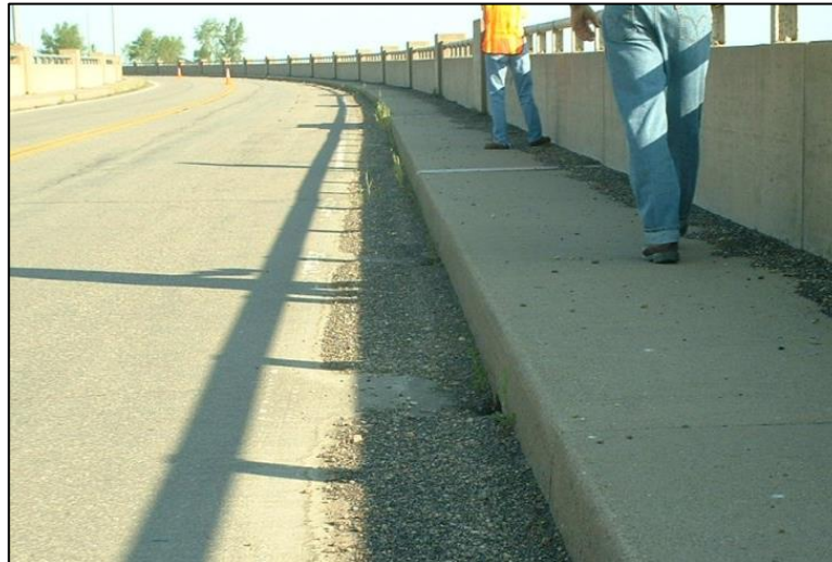
Figure 2.7.1-3: Assessment 9009 – Sidewalk.

It is the inspector's task to examine each sidewalk and reasonably assign the most severe assessment condition to the each assessment. This will quantify the assessments state of deterioration and help generate quantity/cost estimates for future remedial work.