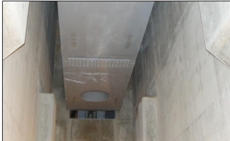
Figure 2.7.1-6: Assessment 9020 – Movable Bridge Counterweight.