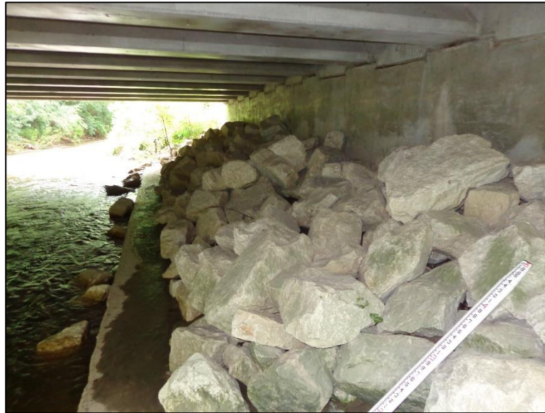
Figure 2.7.1-13: Assessment 9045 – Slope Protection – Riprap.