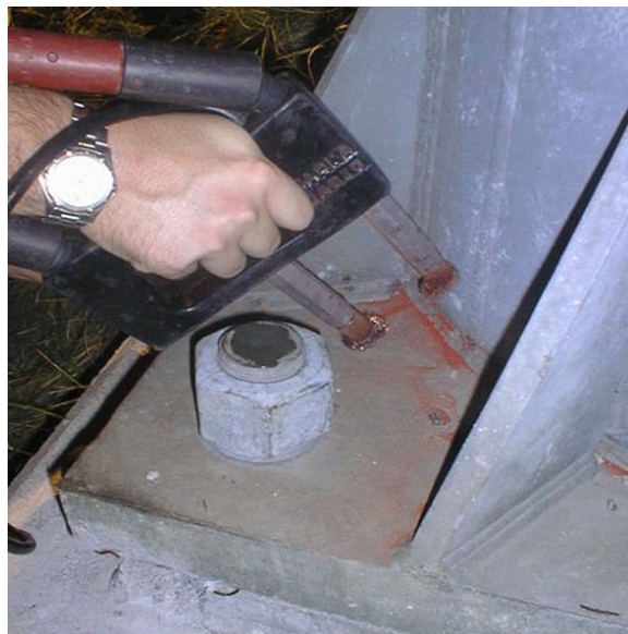
Figure 5.7.2-2: MT on a Sign Structure Base.