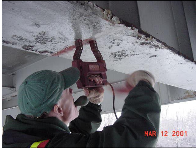
Figure 5.7.2-1: MT on a Built-Up Plate Bridge Girder Butt-Weld.