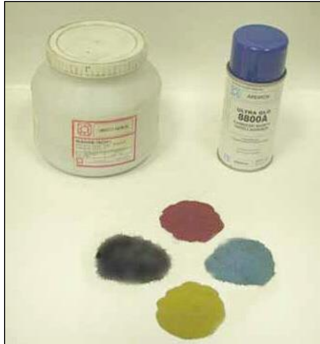
Figure 5.7.1-1: Sample Powder Colors.