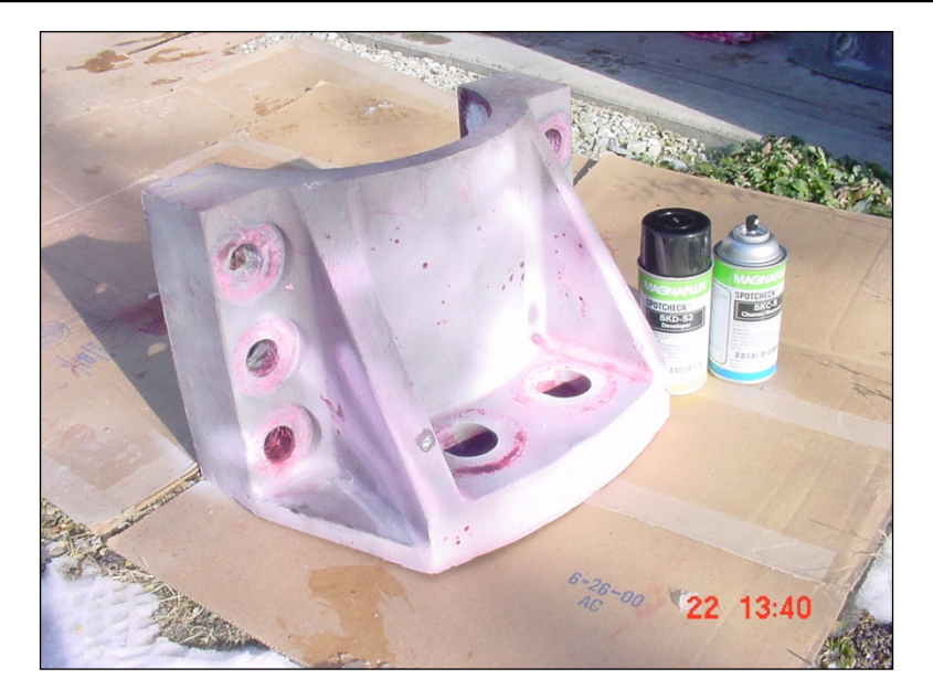
Figure 5.4.1-1: Liquid Penetrant and Developer Applied to a Casting.