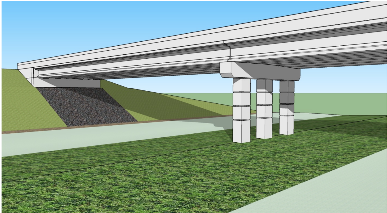
Figure 4.9-1 Aesthetic Concept Type I