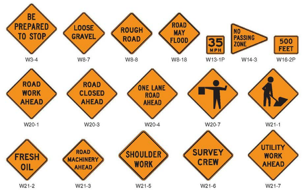
Figure 5G-1. Temporary Traffic Control Signs and Plaques on Low-Volume Roads

Some of the signs that might be applicable in a temporary traffic control zone on a low-volume road are shown in Figure 5G-1.