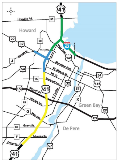
I-41 Brown County Improvements.