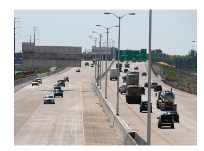
New I-41 Causeway and Bridge.