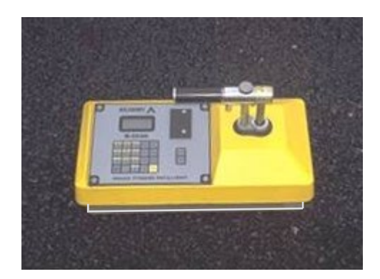
Figure 2: Nuclear gauge orientation for (a) 1<sup>st</sup> one-minute reading and (b) 2<sup>nd</sup> one-minute reading

Photos should be taken of each of the 10 core/gauge locations of the test strip. This should include gauge readings (pcf) and a labelled core within the gauge footprint. If a third reading is needed, all three readings should be recorded and documented. Only raw readings in pcf should be written on the pavement during the test strip, with a corresponding gauge ID/SN (generalized as QC-1 through QV-2 in the following Figure) in the following format: