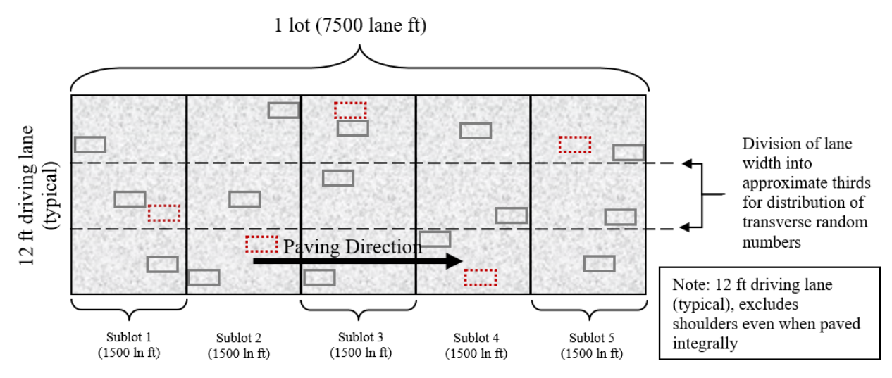
Figure 4: Locations of main lane HMA density testing (QC=solid lines, QV=dashed)

randomly selected location per sublot. The QV is also comprised of two one-minute readings oriented 180 degrees from one another. For both QC and QV test locations, if the two readings exceed 1.0 pcf of one another, a third reading is conducted in the same orientation as the first reading. In this event, all three readings are averaged, the individual test reading of the three which falls farthest from the average value is discarded, and the average of the remaining two values is used to represent the location for the gauge. The sublot density testing layout is depicted in Figure 4, with QC test locations shown as solid lines and QV as dashed.