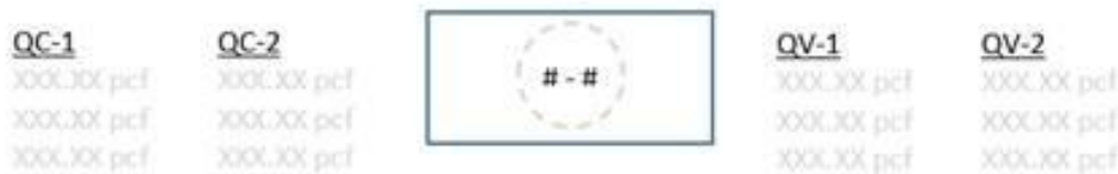
Figure 3: Layout of Raw Gauge Readings as Recorded on the Pavement

Take photos of each of the 10 core/gauge locations of the test strip. Include gauge readings (pcf) and a labelled core within the gauge footprint. If a third reading is needed, record and document all three readings. Only raw readings in pcf shall be written on the pavement during the test strip, with a corresponding gauge ID/SN (generalized as QC-1 through QV-2 in the following Figure) in the following format: