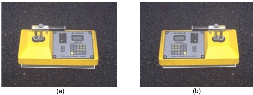
Figure 2: Nuclear Gauge Orientation for (a) 1 st One-Minute Reading and (b) 2 nd One-Minute Reading

The nuclear site is the same for QC and QV readings for the test strip, i.e., the QC and QV teams are to take nuclear density gauge readings in the same footprint. Each of the QC and QV teams are to take a minimum of two one-minute readings per nuclear site, with the gauge rotated 180 degrees between readings, as seen here: